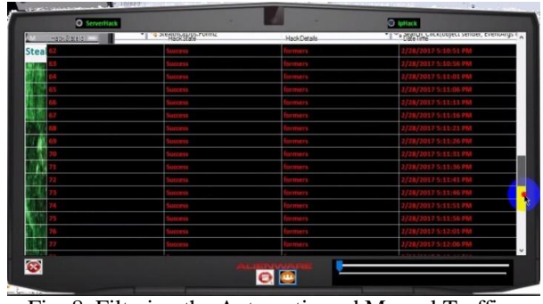
Fig. 8. Filtering the Automatic and Manual Traffic.