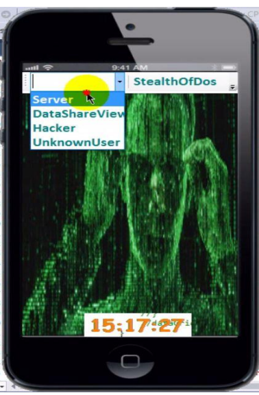
Fig. 4. Main screen of the System

And provide the glimpse of what actually happens.