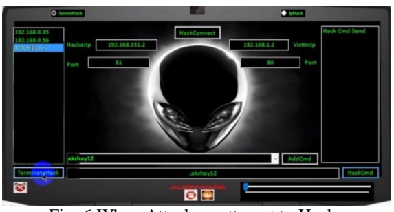
Fig. 6. When Attackers attempt to Hack.