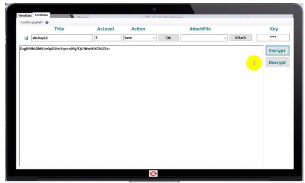
Fig. 5. Data encryption for better Security by the User